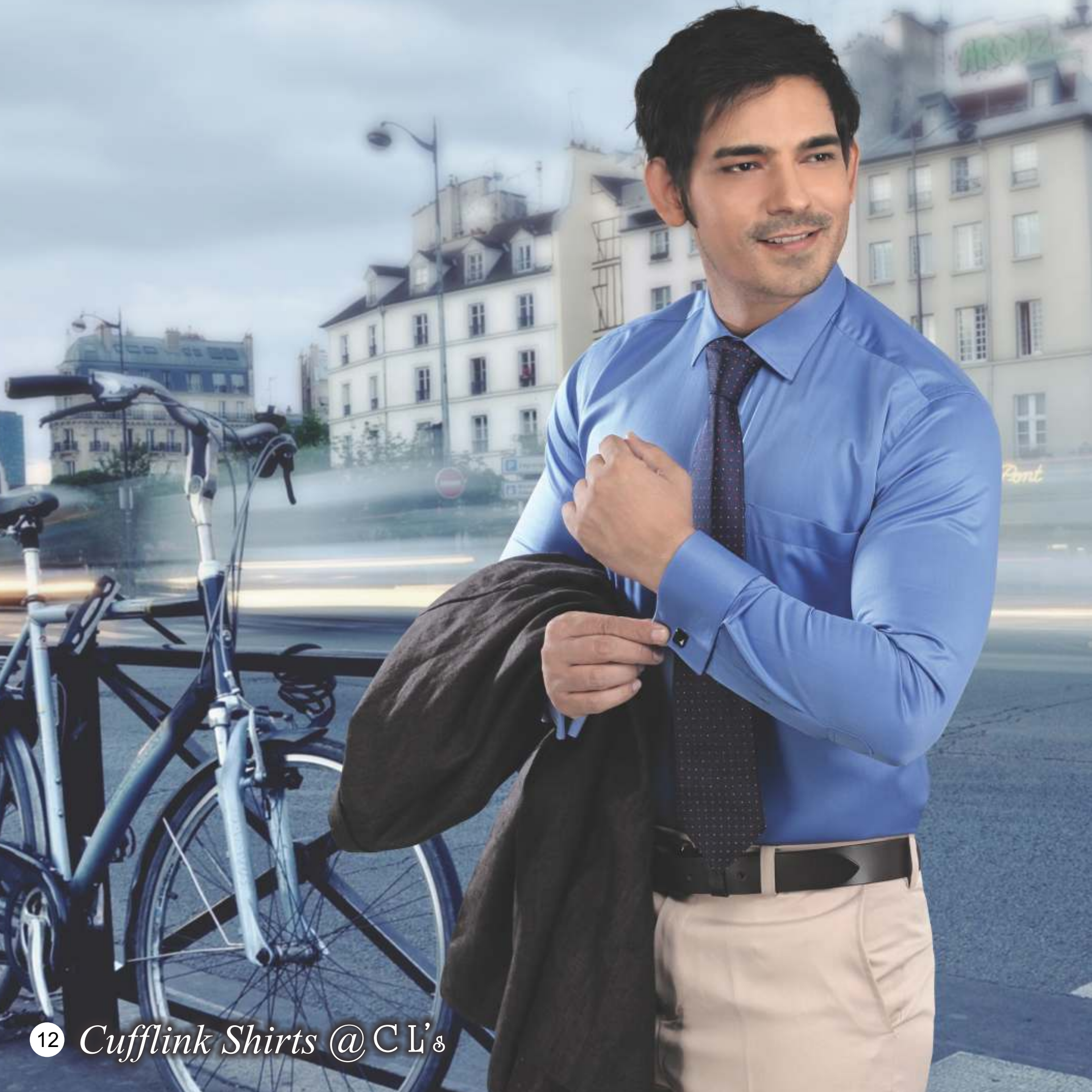
12 Cufflink Shirts @ C L's