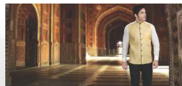
Traditional Koti Shirts