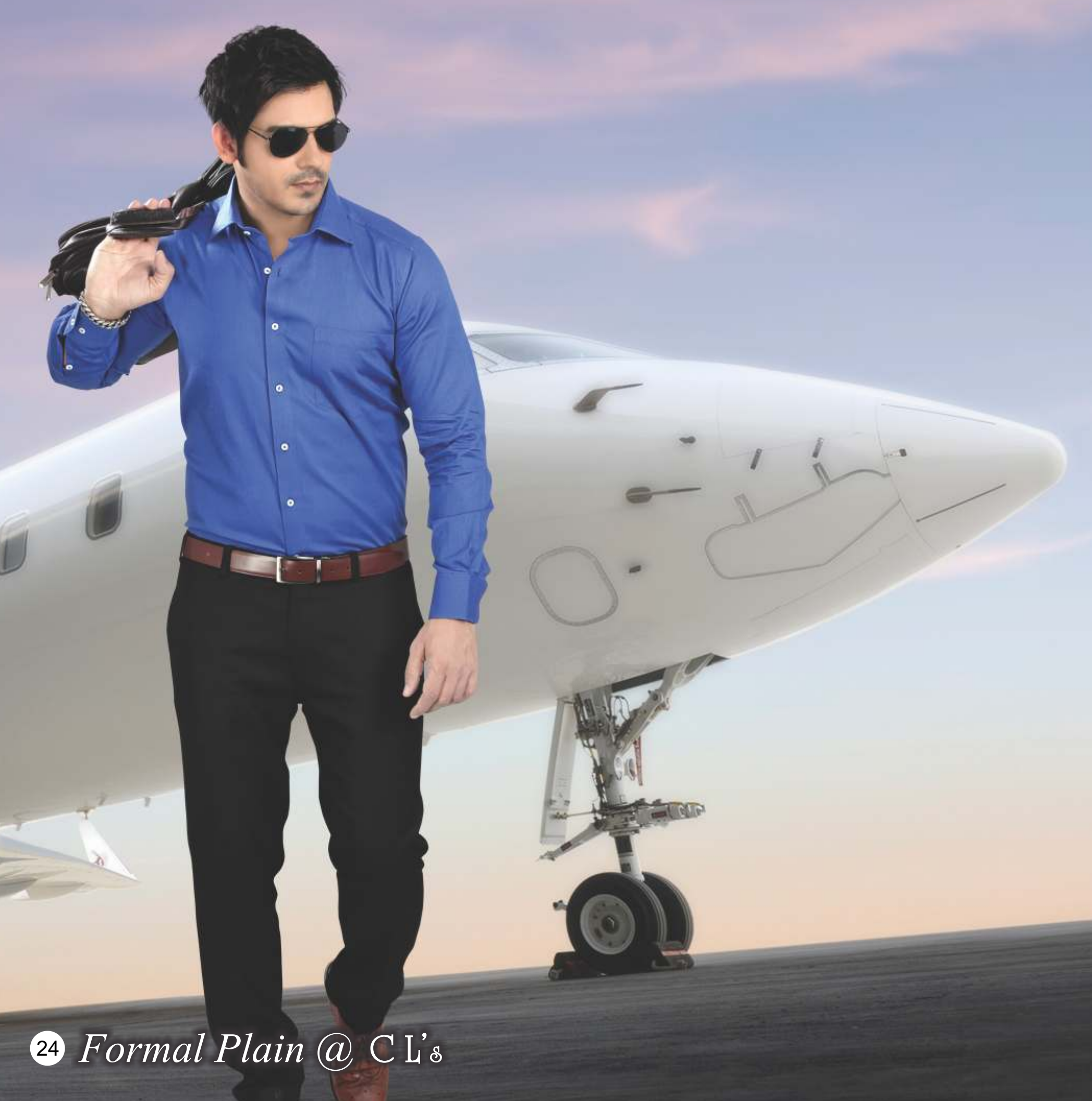
24 Formal Plain @ CL's