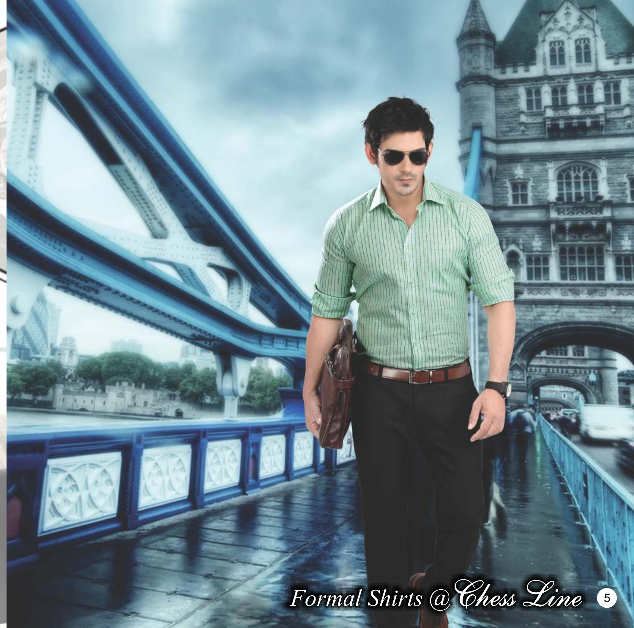
Formal Shirts @ Chess Line 5