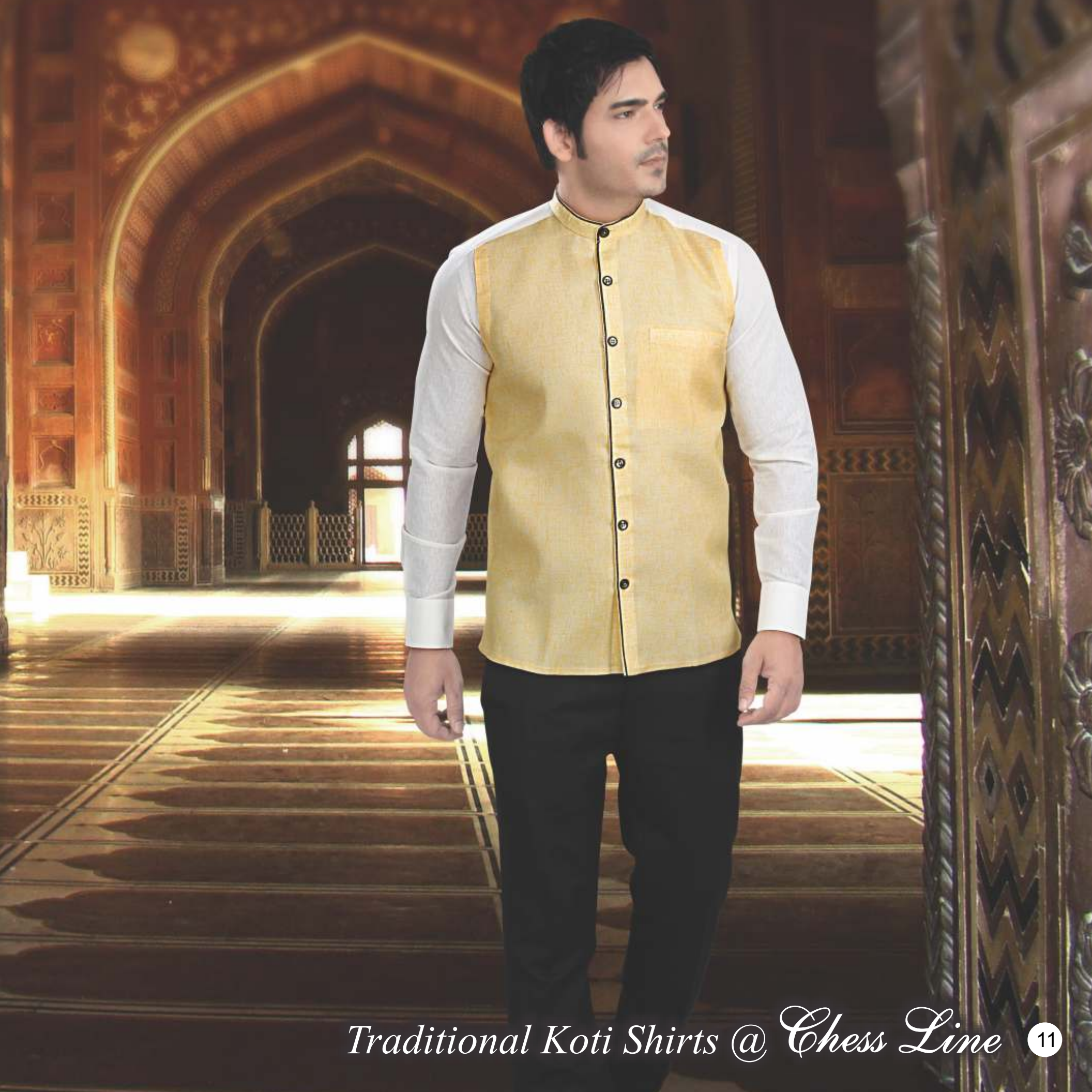
Traditional Koti Shirts @ Chess Line 11