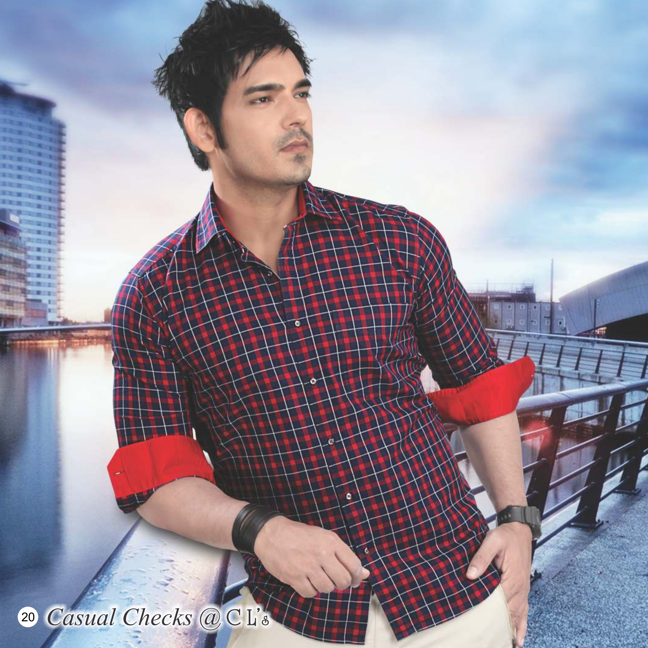
20 Casual Checks @ C L's