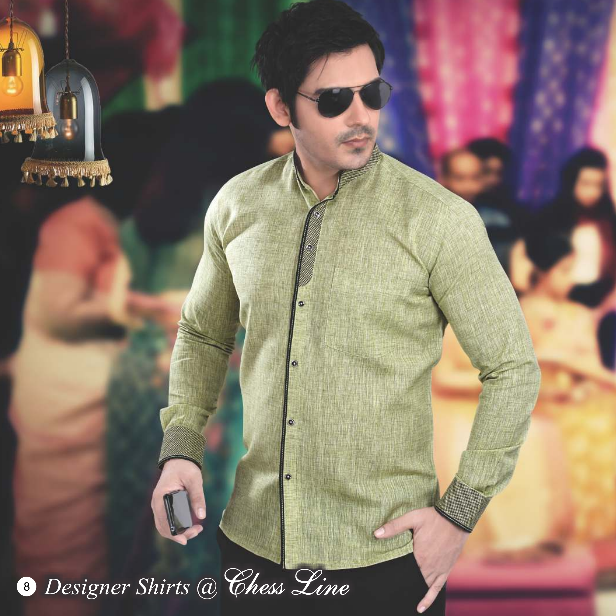
8 Designer Shirts @ Chess Line