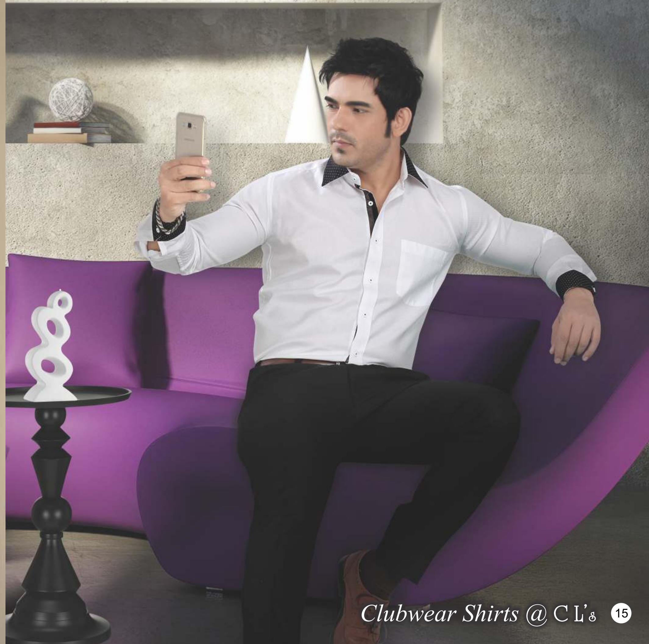
Clubwear Shirts @ C L's 15