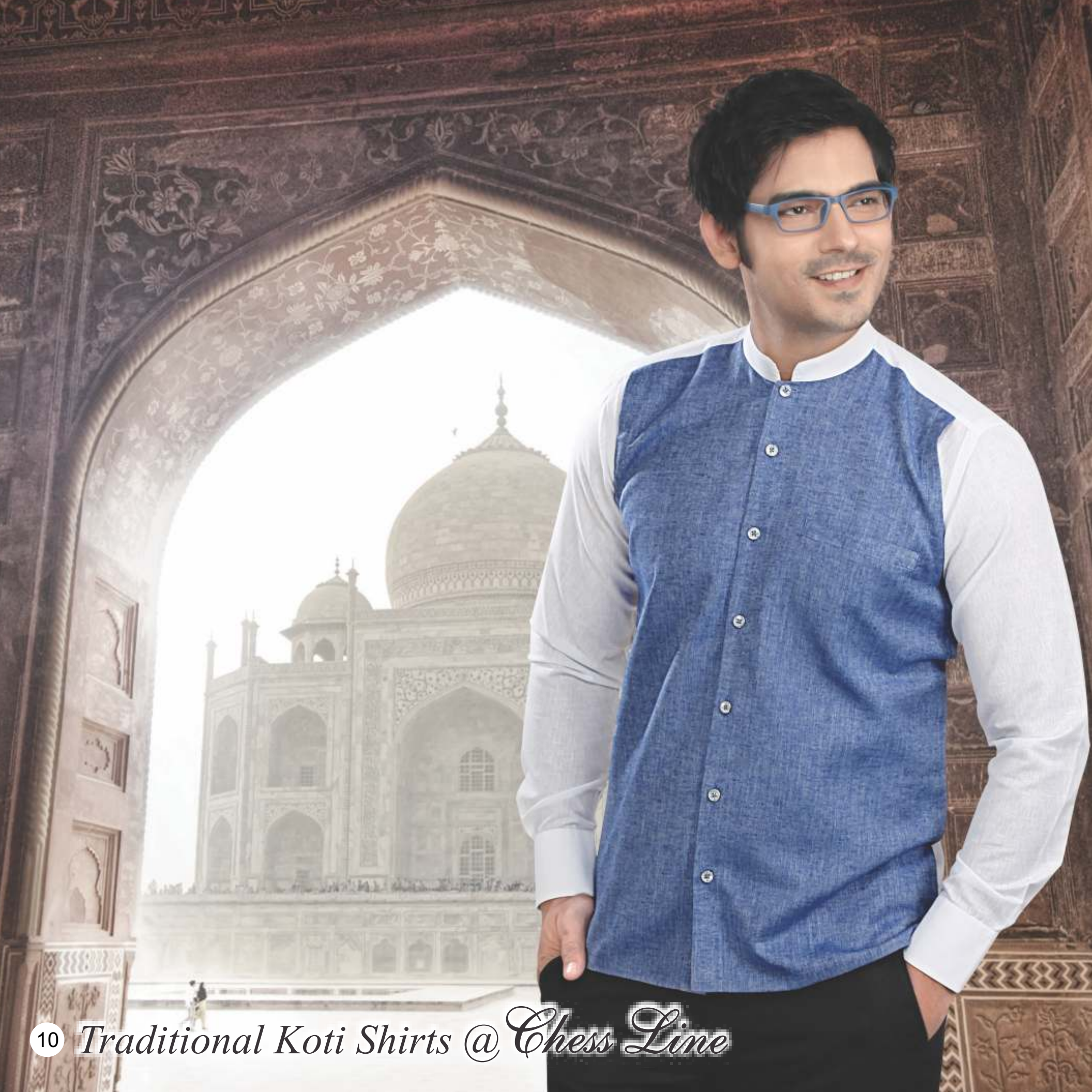
10 Traditional Koti Shirts @ Chess Line