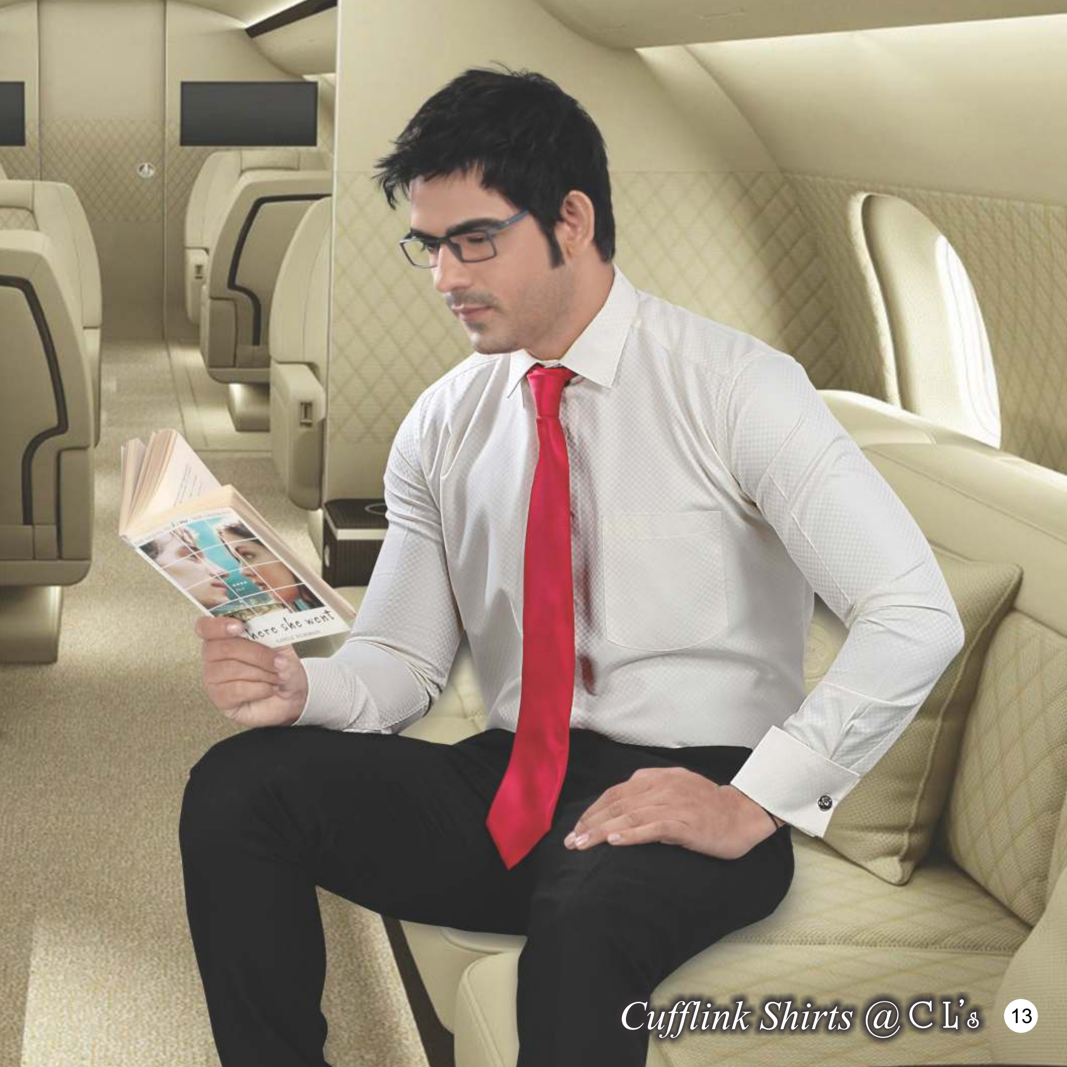
Cufflink Shirts @ C L's 13