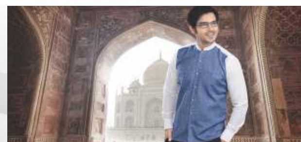
Traditional Koti Shirts