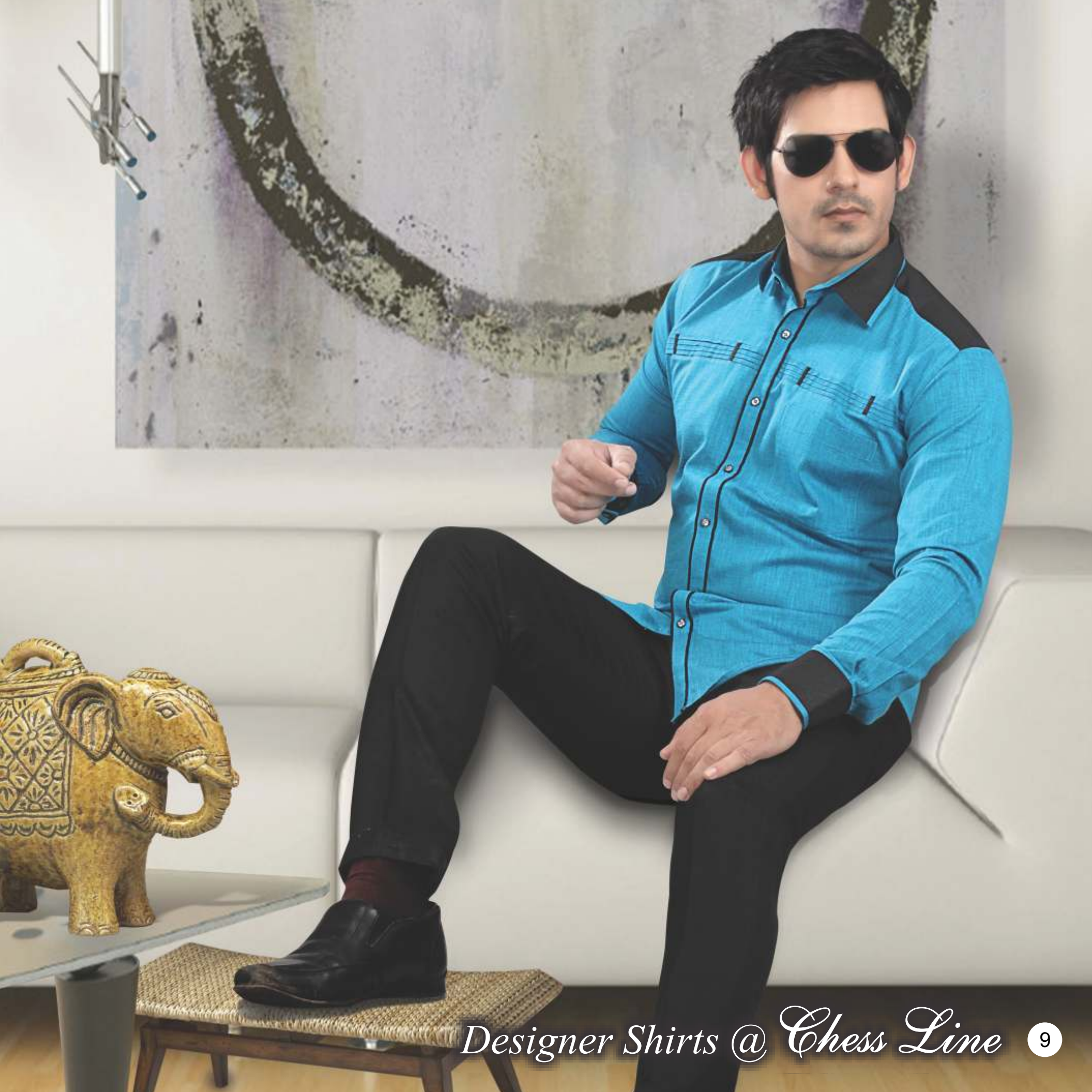
Designer Shirts @ Chess Line 9