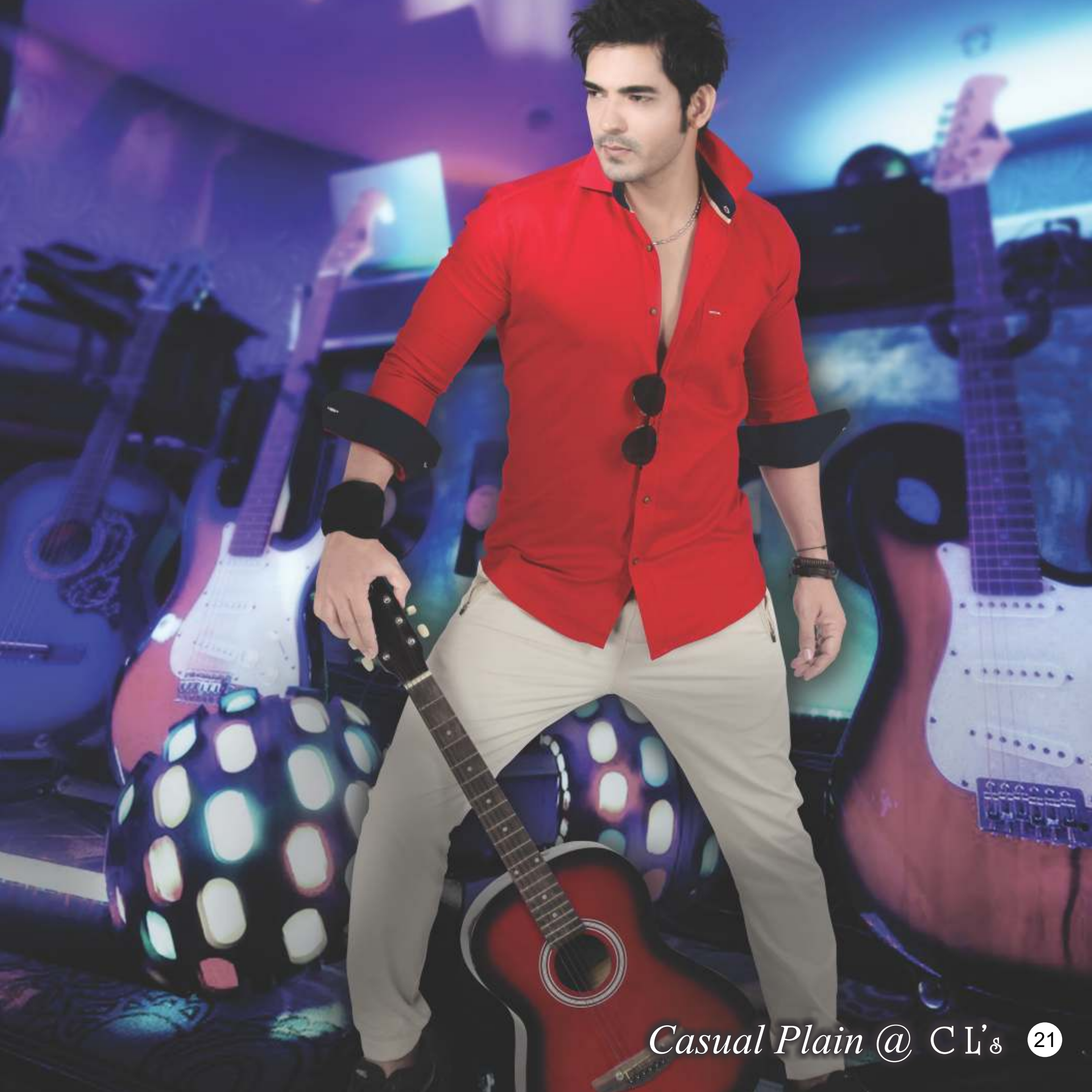
Casual Plain @ C L's 21