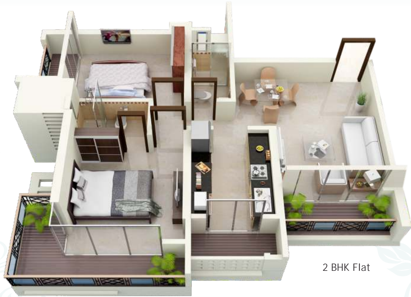
2 BHK Flat