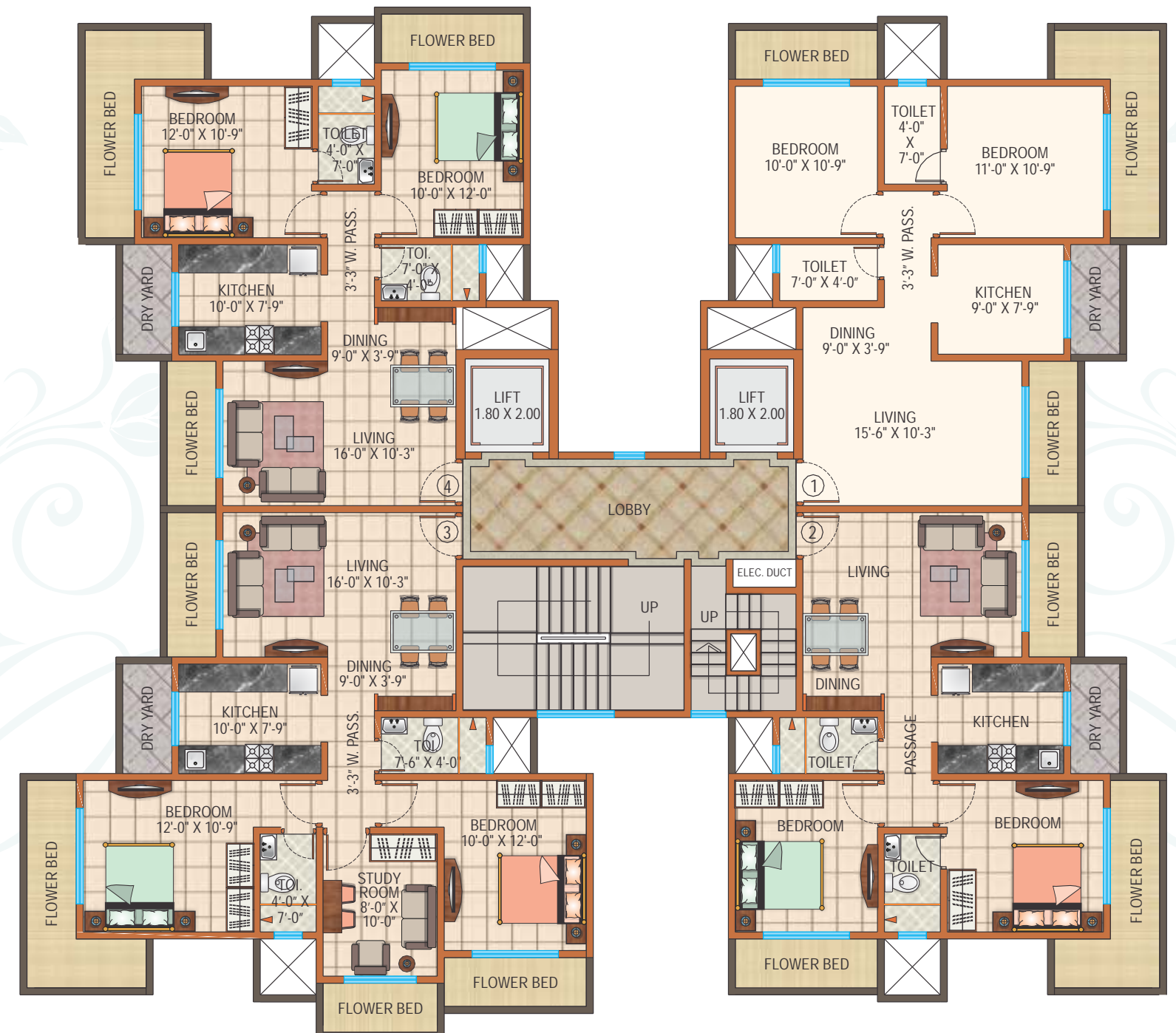
2ND TO 7TH & 9TH TO 14TH & 16TH TO 19TH FLOOR