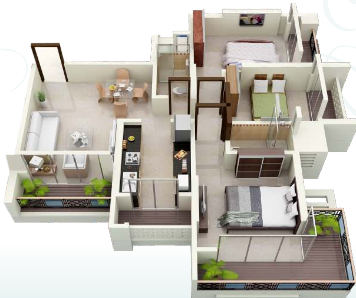
2 1/2 BHK Flat